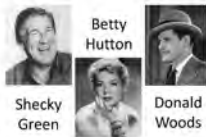
Betty Hutton Shucky Green Donald Woods