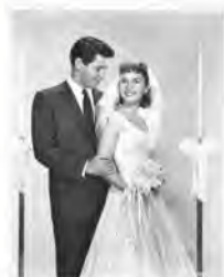
Eddy Fisher & Debbie Reynolds