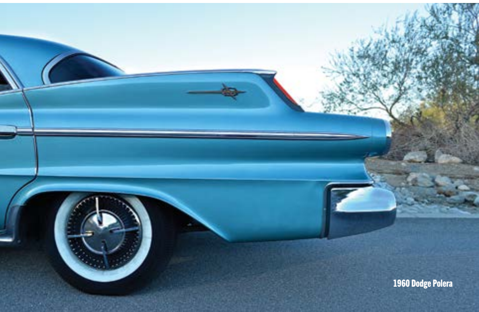
1960 Dodge Polara

Twin Palms residents are some of the car-savviest folks around. Keep your eye out for some carport adornments.