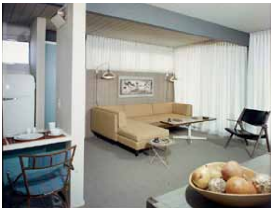
Ocotillo Lodge rooms with interiors by Tony Dalu around the time of its opening in 1957.